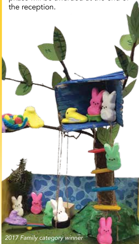
2017 Family category winner

Thursday, March 22, 7-8 pm Everyone is invited to celebrate with the creators and get their vote in for the "Peeples Choice Award." All prizes will be awarded at the end of the reception.