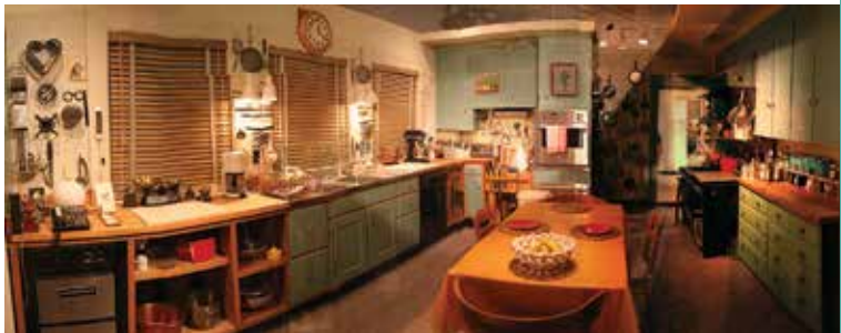
Replica of Julia Child's kitchen at the National Museum of American History