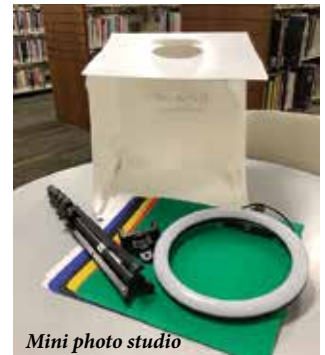
Mini photo studio