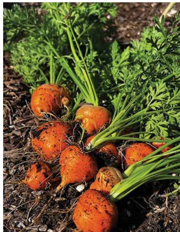
Paris Market carrots

You can sign up for our periodic Growers newsletter which will give you tips and best practices throughout the important stages of the growing season: planting, harvesting, and seed saving. You'll also find helpful resources for your gardening adventure, whether you're a beginner or experienced grower | caryarealibrary.org/seedlibrary